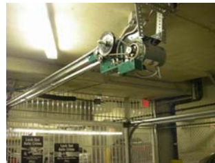
OVERHEAD GATE MOTORS