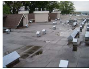
FLAT (LOW SLOPE) ROOFS

Some additional projects during this stage include: exterior sealant replacement, replacement of failed sealed glazing units, and overhaul of sump pumps. We have included some reference photographs of these types of assets.