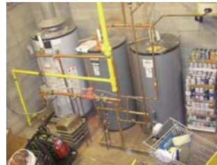
DOMESTIC WATER HEATERS

Some additional projects that may occur during this stage are: exterior sealant renewals, balcony membrane resurfacing, hallway carpeting replacement and sump pump overhauls. Included below are some reference photographs of a few of the assets that may require renewal during the 2nd lifecycle stage.