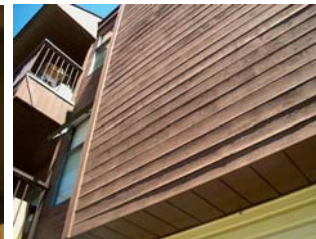
WALL AND WINDOW ASSEMBLIES