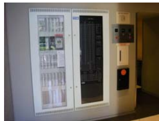
FIRE ALARM PANELS