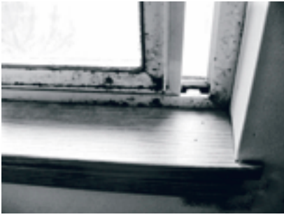
Residents can carry out a few basic inspection and maintenance tasks on the interior side only, such as cleaning the sills, frames, door surfaces or glass.