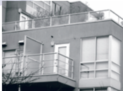
Windows and exterior doors deteriorate over time due to age, wear and tear and the weather, and require ongoing inspection and maintenance.