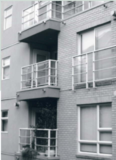
Windows and exterior doors require regular semi-annual inspections, for example each spring and fall.