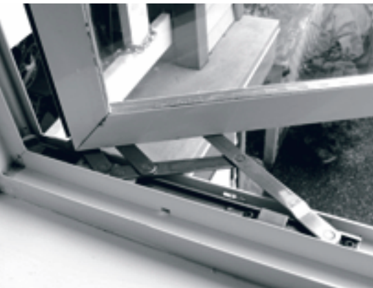
Weather-stripping and operating hardware for your windows are important maintenance items.