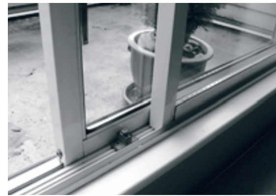
Your windows and doors should operate smoothly and lock securely.

Residents can carry out a few basic inspection and maintenance tasks on the interior side only, such as cleaning the sills, frames, door surfaces or glass. Beyond this, however, residents should report symptoms of potential problems or maintenance concerns to the building manager. Specific inspection and maintenance items will depend on the type of windows and exterior doors that you have. Ensure that any maintenance guides for your building are referenced and closely followed, as well as any information provided by the window or door manufacturer. A checklist of common window and door maintenance items is described in more detail on page 3.